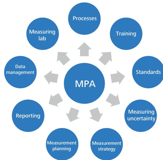
Possible modules of the measuring process optimization

The results are documented and visualized in an extensive report, a summary presentation and in a certificate. This documentation contains specific recommendations and descriptions of improvement measures that will enable you to effectively and sustainably improve specific processes.